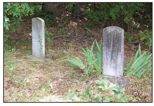
Cemetery in the Woods

Some examples of non-forested sites that you may want to consider protecting as special sites are caves, seepage slopes, rocky outcrops, riparian areas, water bodies (creeks, rivers, pools and ponds), natural openings in the forest such as prairies, glades and dry sandhills. These sensitive sites harbor many of the critically imperiled and imperiled aquatic and terrestrial species. Temporary pools that fill up with water in the spring are especially important features that contain rare, threatened and endangered species. All of these areas are important and are often very easy to work around.