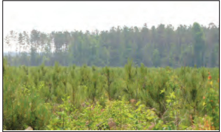
Proper planning prior to reforestation can ensure a healthy and productive forest in the future.

Louisiana Forestry Association can assist with contacting private/industrial firms with cost sharing or landowner assistance programs, http://www.laforestry.com